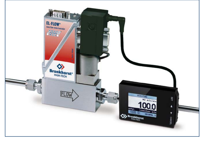
Example of pipe mounting by means of the mounting kit